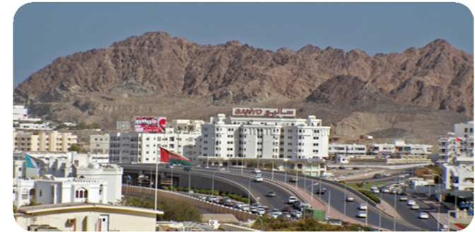
AIS International – Dubai Silicon Oasis